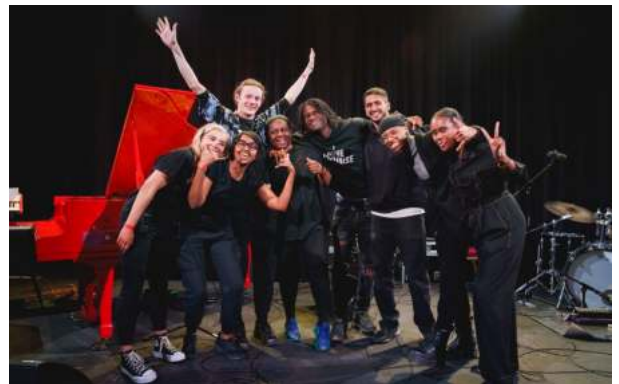
Young Producers, May 2022