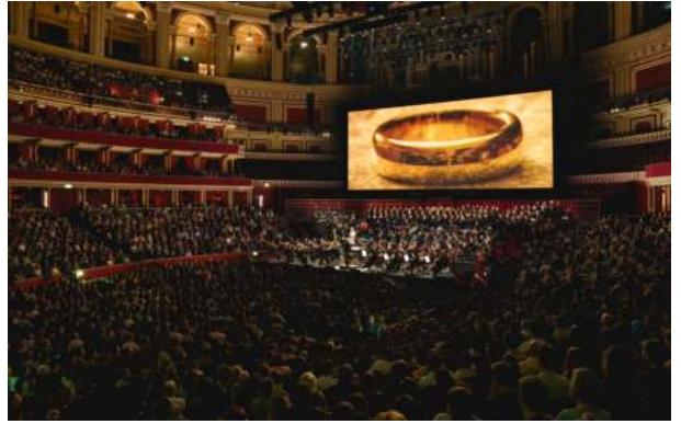
Lord of the Rings: The Fellowship of the Ring, May 2022