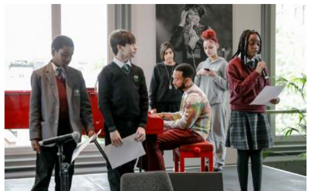
John Legend Workshop, April 2022