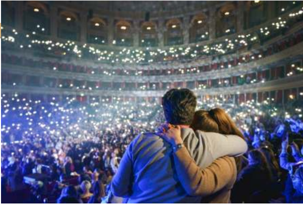
James Arthur, March 2022