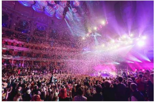
YUNGBLUD, TCT March 2022