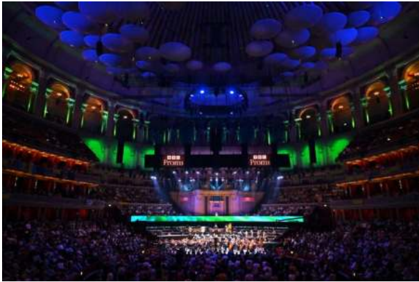
BBC Proms, July 2022