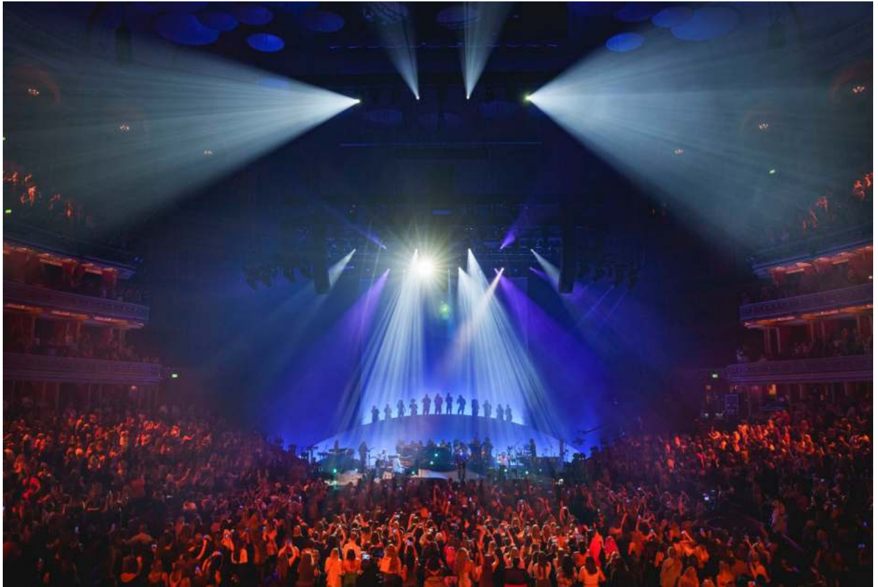
5 Seconds of Summer, September 2022