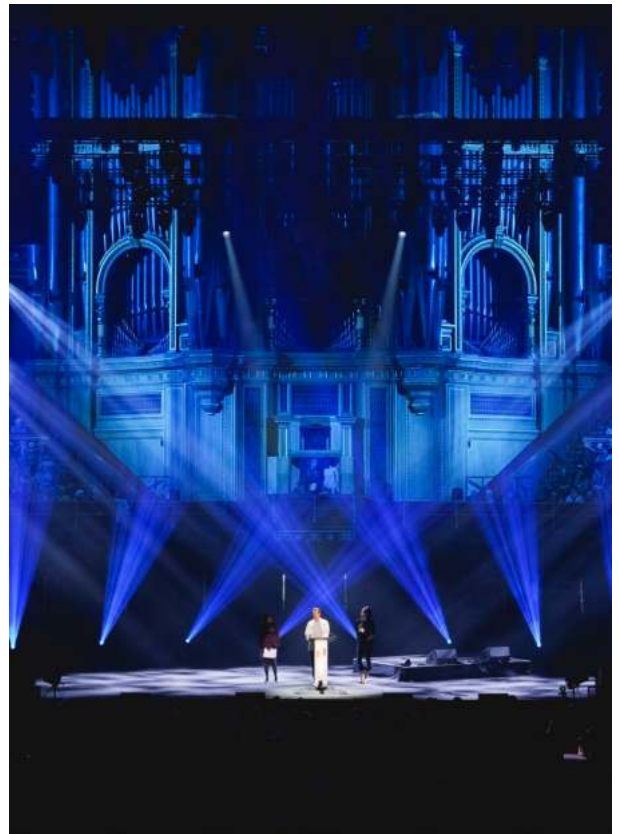
Benedict Cumberbatch performing at Letters Live, November 2022

Together, our artists, audiences, staff and supporters are continuing to write the story of this very special place.