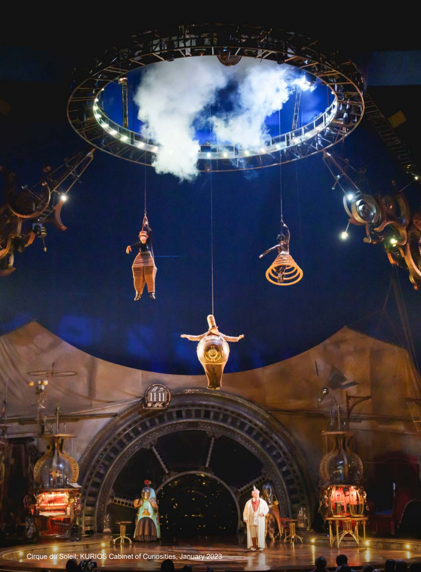
Cirque du Soleil: KURIOS Cabinet of Curiosities, January 2023