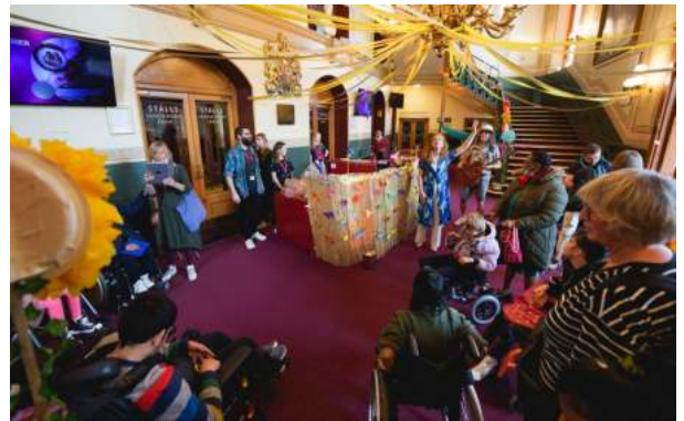
Sensory Journey, October 2023

Thank you so much for your outreach work! It has changed our life for the better."