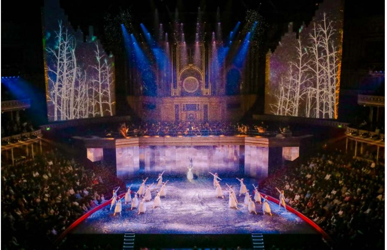
The Nutcracker, December 2022